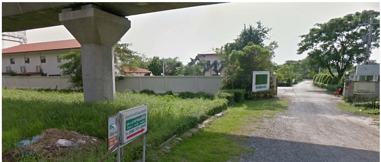
The entrance to the Sripiamsuk Resort is beneath the Expressway